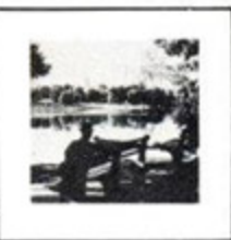
35mm color slide